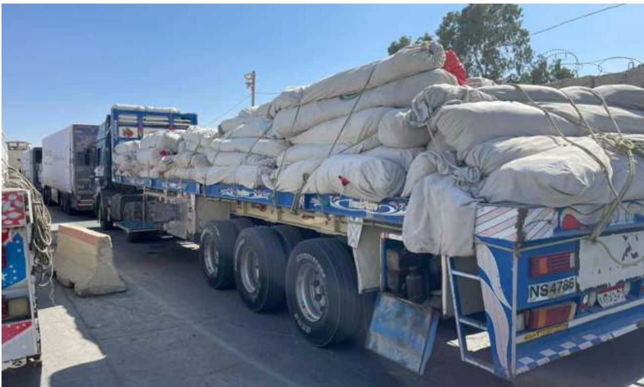
Trucks entering Rafah Crossing, carrying humanitarian aid, including food, medical supplies and water.

Throughout the period following the Hamas attacks, Israel has continued to allow inspected humanitarian aid to reach Gaza, including at least 700 trucks of supplies, through the Rafah crossing with Egypt, and in coordination with the United States, Egyptian authorities and the United Nations.