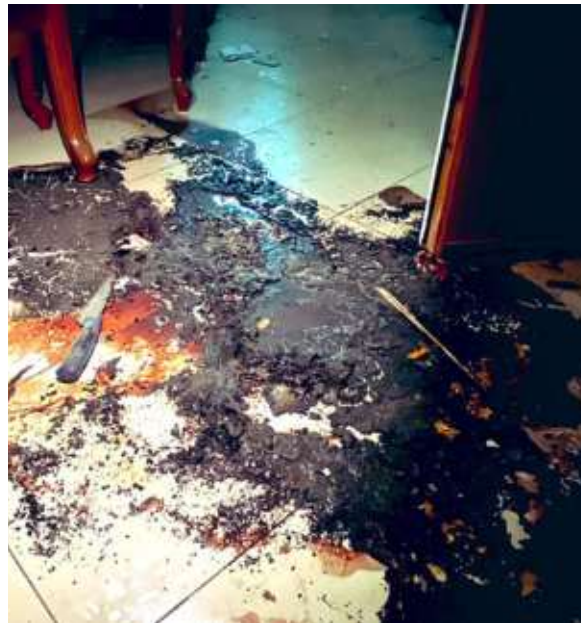
Bloodstained room in Kibbutz Be'eri, Southern Israel.

In short, what Hamas is carrying out is a triple war crime: using civilians in Gaza as human shields to attack civilians in Israel, while seeking the destruction of the Jewish state.