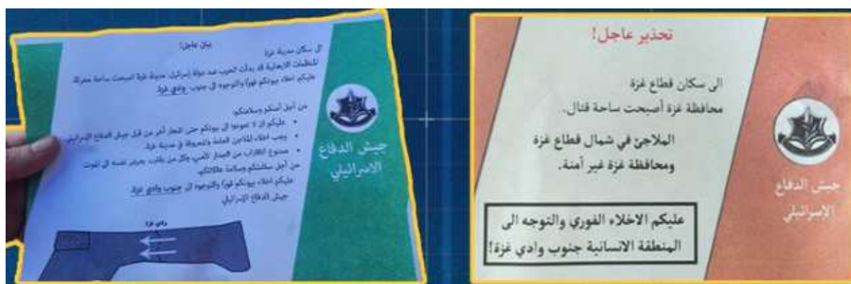
Letters from IDF to civilians in northern Gaza, suggesting to evacuate south

Throughout this campaign, Israel has issued repeated warnings for civilians in Gaza to evacuate defined areas, ahead of impending strikes. Many critics have charged that this amounts to 'forced displacement', which is a violation of international humanitarian law and a crime against humanity, pursuant to Article 7 of the Rome Statute . However, this is highly erroneous and a gross misinterpretation of both the law and Israel's intentions in providing such warnings.